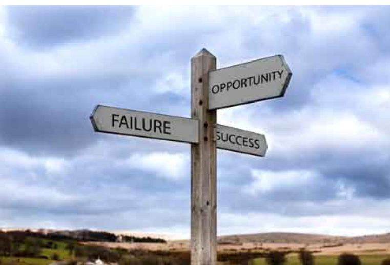
The success of your rural housing policy will depend on good evidence

An evidence based approach is promoted through the work of the Planning Inspectorate, and given added emphasis through the recently introduced Single Conversation process. With input from the public, private, housing association and voluntary sectors, the Single Conversation is intended to set out the long-term development priorities of authorities through Local Investment Plans and Local Investment Agreements .