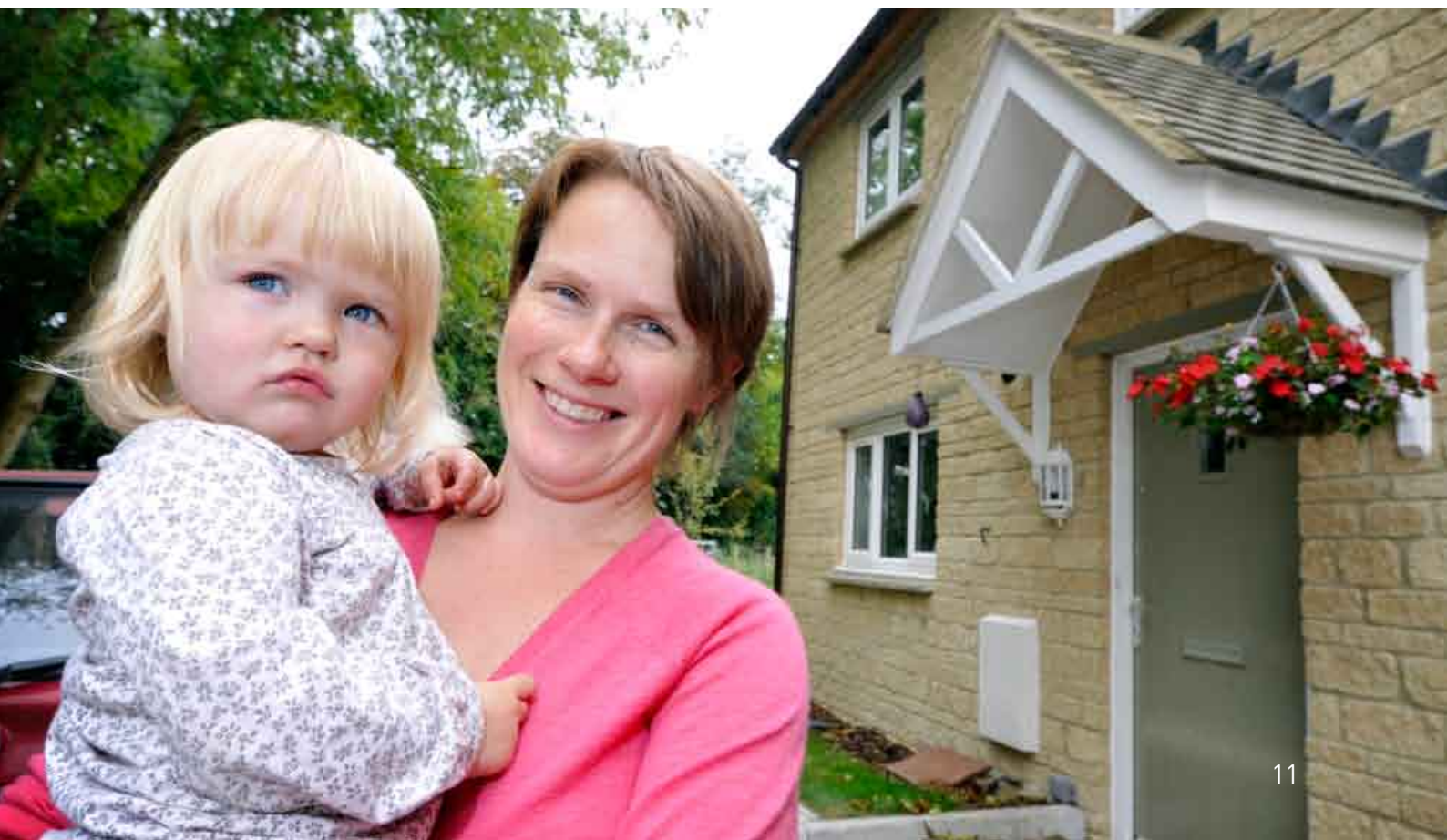
Residents of Cottsway Housing's new homes in Ramsden, Oxfordshire

HARAHA has been quoted as an example of best practice by the Housing Corporation's Future Investment Approaches , the Affordable Rural Housing Commission's Final Report , and the Commission for Rural Communities' Making it Happen: HARAHA .